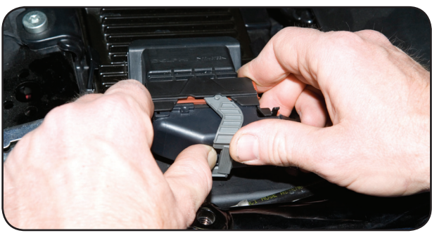
Remove seat, exposing factory computer (ECU). disconnect factory wiring by pressing lock and pushing lever back.

PLEASE NOTE: FUELPAK USE REQUIRES A HIGH PERFORMANCE AIR FILTER.