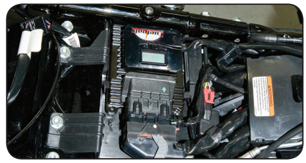
Attach Fuelpak to the top of the ECU by using the supplied Velcro.